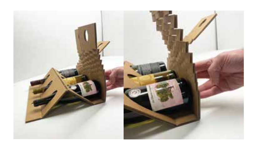
9 • Fold up bottom as shown.