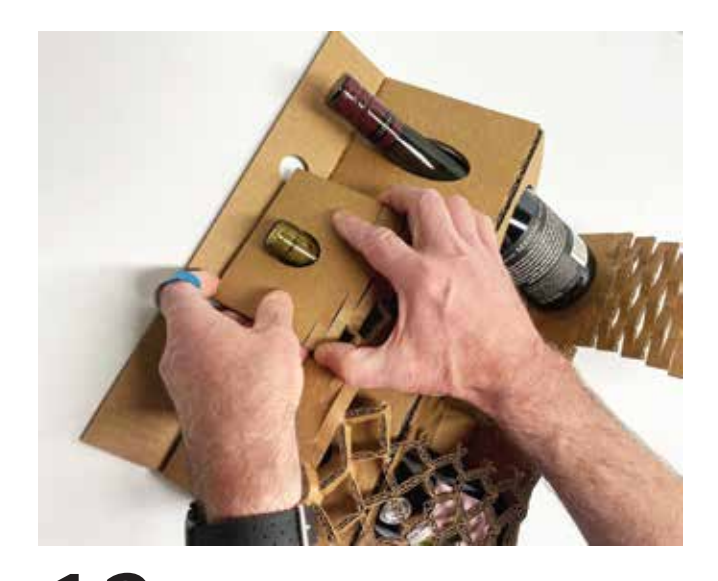
12. Repeat for middle bottle.