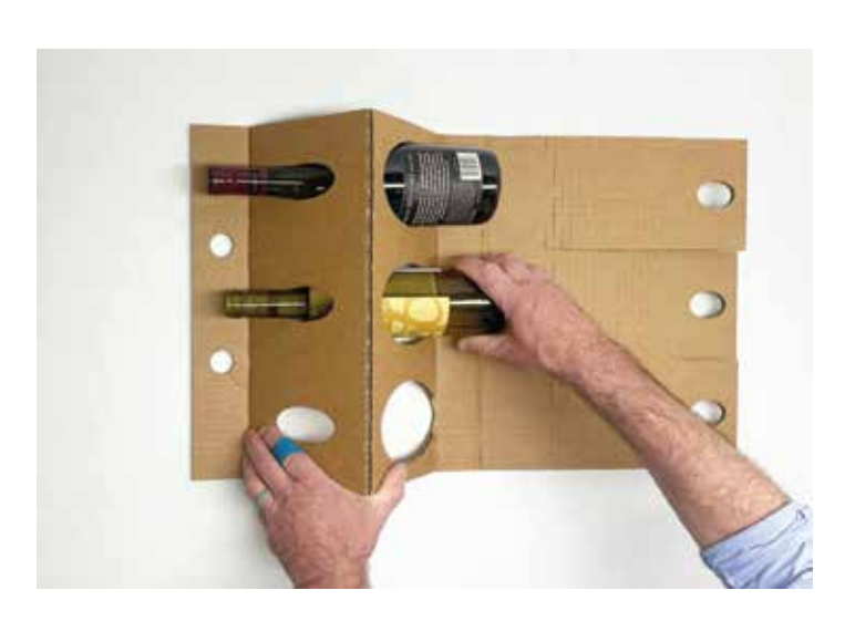
4 Insert 2nd Bottle