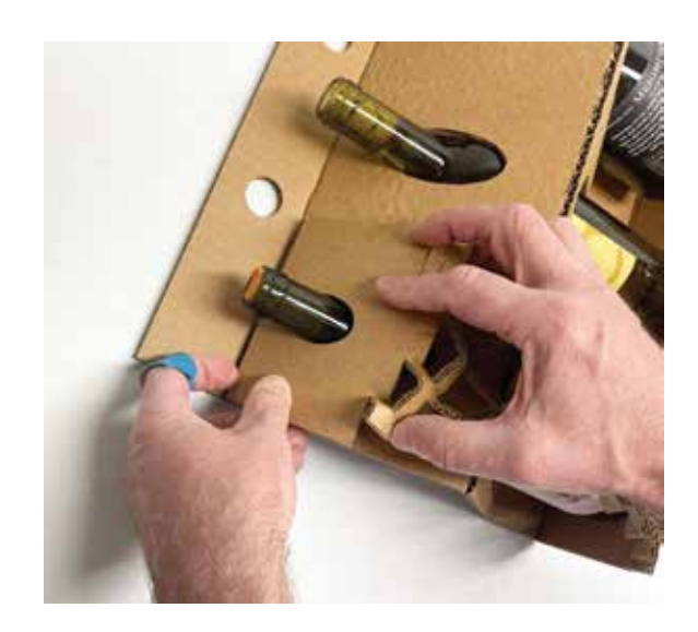
Place hole in bottom panel over bottle neck.