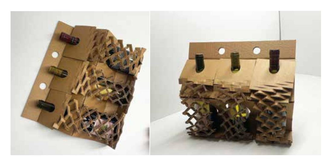
13. Repeat for 3rd bottle.