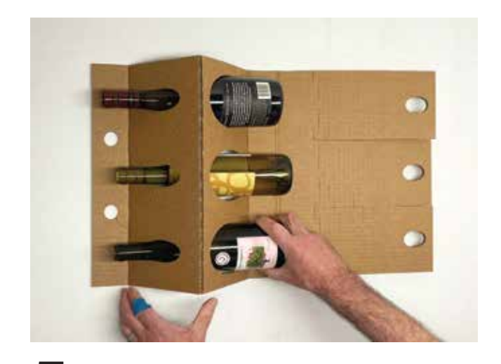
5. Insert 3rd Bottle