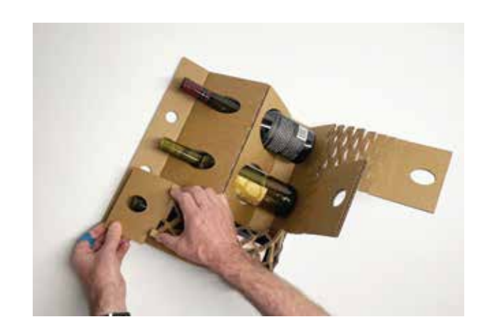
10. Pull Stretched panel to top.