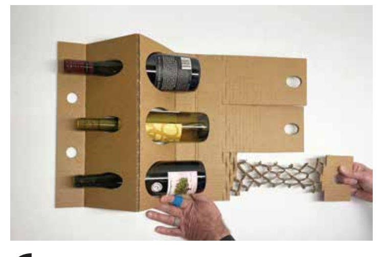
6. Stretch 1st bottom panel as shown.