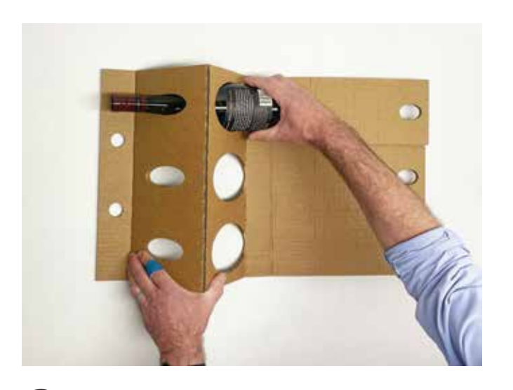
3. Insert 1st Bottle