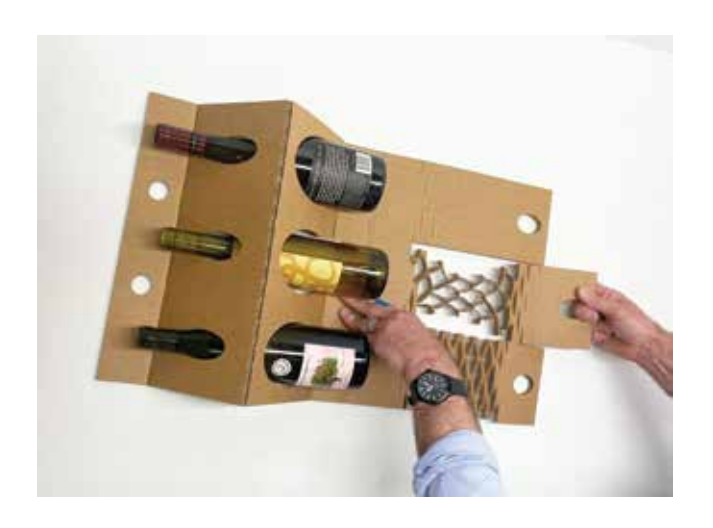
7 • Repeat at middle bottom panel.