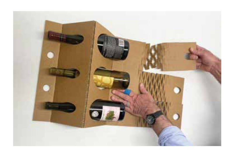
8. Repeat for 3rd panel.